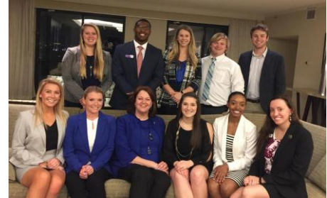
Students attend 90th Annual Club Managers Ass'n of America's conference in Orlando

The university completed a successful SACSCOC review and the College had a productive 2016-17 academic year, as well! SACSCOC approved our new QEP, Degree Plus , which focuses on the development of our students' professional skills, such as teamwork, leadership and communication. College of Business students enjoyed numerous engaged learning activities this year. The fall featured the second annual Pitch party in which six students participated in Cullowhee's version of shark tank. Finance students competed against 44 collegiate student teams in the Conference of State Bank Supervisors 2017 Community Bank Case Study Competition. Their consulting project on our local Integra Bank placed among the top fifteen teams in the country. A