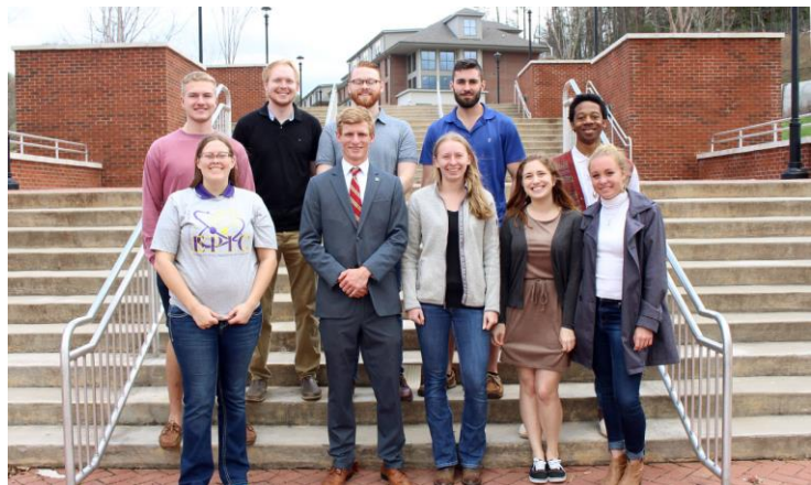
EPIC students, faculty present trade show on Central Plaza