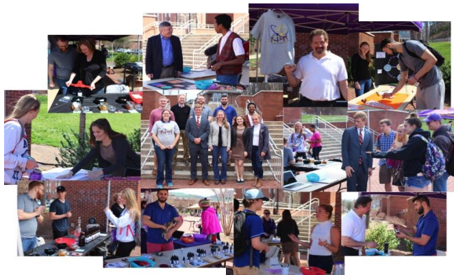
Student Startup Entrepreneurs at EPIC Spring Trade Show, March 31, 2017